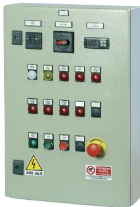
SCA400-MECP Main Electric Control Panel