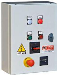
SCA150-MECP Main Electric Control Panel