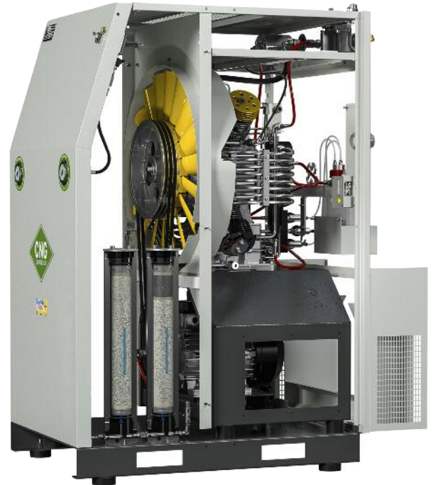
SCA400E43/CNG Filter housings